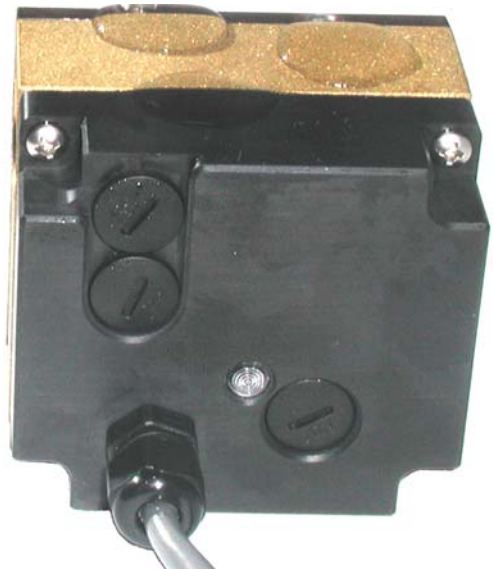
O-ring sealed screw caps give access to the 16-step and fine trip adjustment switches.